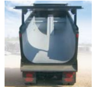
Elliptical style dump body.