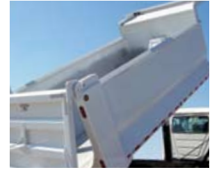
Standard tailgate. Hi-lift option shown on cover.