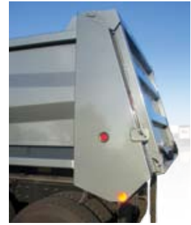
Full depth rear corner post for stability and durability