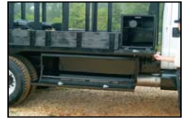
18" x 18" x 72" Tool box.