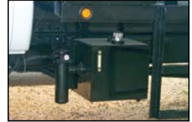
Side mounted hydraulic tank with sight gauge.