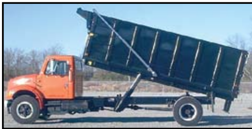
Twin Telescopic Hoist