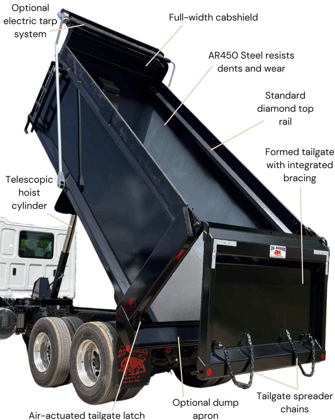
Air-actuated tailgate latch